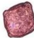
Moniezia (tapeworm - cattle)