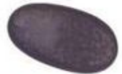
Mite Egg - 1/4 actual size (contaminant - often mistaken for worm eggs)