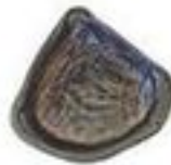
Moniezia (tapeworm - sheep)