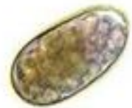
Oesophagostomum (nodular worm)