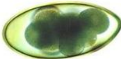
Nematodirus (threadneck worm)